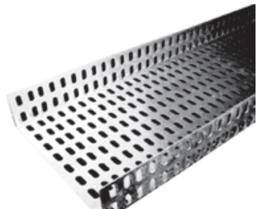
MCT/HCT (3000mm Std. Length)

Splice Sets for 457mm & 610mm 243.60 Ea.