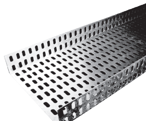
MCT/HCT (3000mm Std. Length)

Material Thickness: 1,6mm up to 305mm and 2,0mm for 457 & 610mm